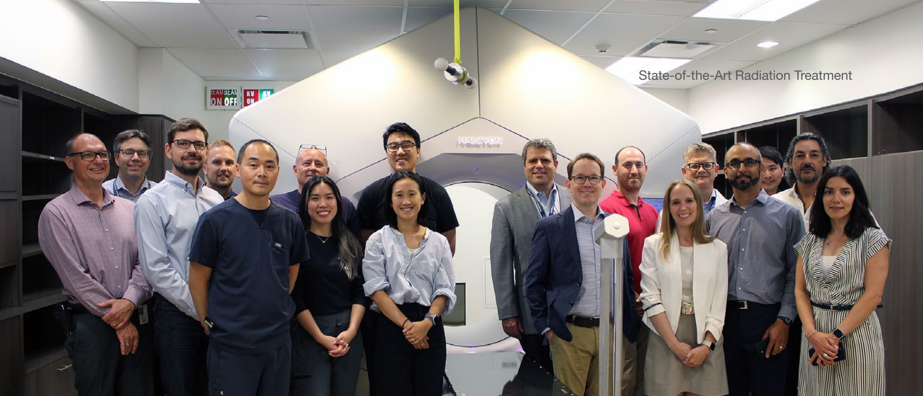
Members of the Radiation Medicine Program at The Princess Margaret with the new Halcyon linear accelerator.